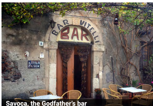
Savoca, the Godfather's bar