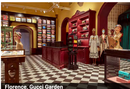
Florence, Gucci Garden