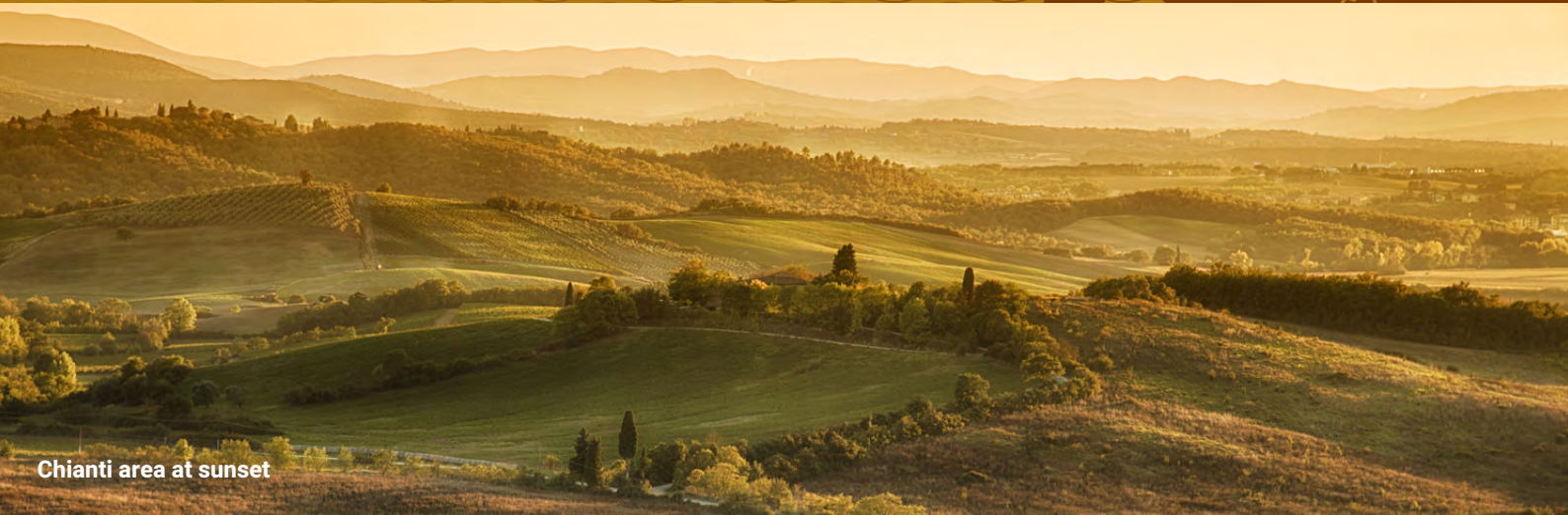
Chianti area at sunset