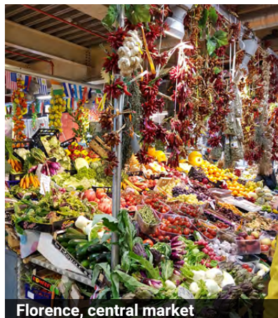
Florence, central market