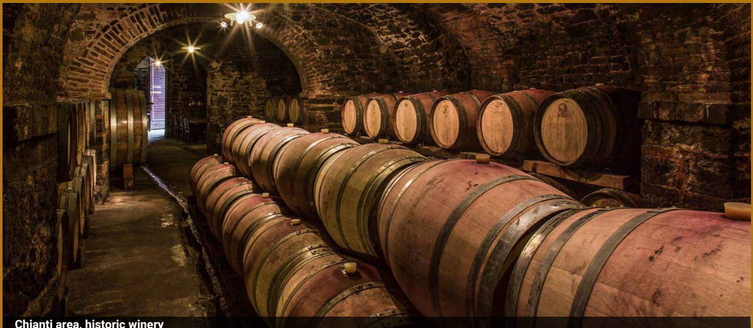
Chianti area, historic winery